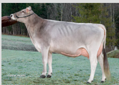
Brown Swiss: PUCK Selina