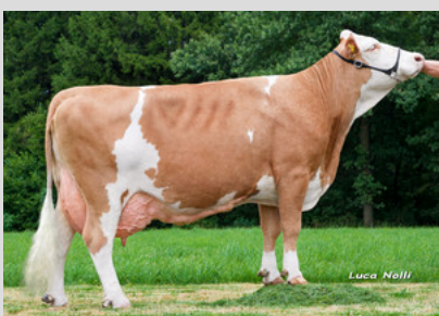
POLARLICHT - granddam Scholla 3.lac.