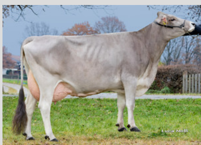
Brown Swiss: HACKER - Minka 4.Lak